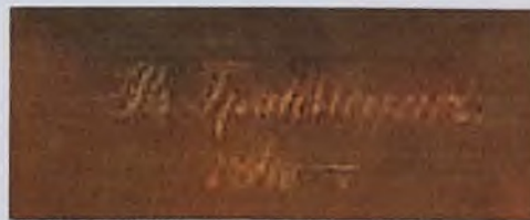
Example of the Signature of Vasilij Tropinin on his painting "Selfportrait of V.Tropinin", State Tretyakov Gallery, Moscow

Lower on the backside of portrait under written "В.Тропининъ" is written year of painting "1834." Which where renewed in the 20 th century and put new black ink and changed numbers on "7834." Probably with a purpose of the saving of this painting in private collection and avoid of expropriation by soviet authority.