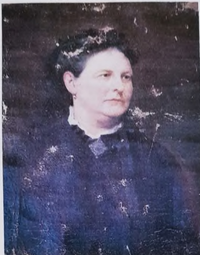
Front Side of the Painting "Portrait of the Landlord's Wife"