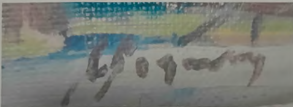
Example of the Signature of Stepan Sighetiy on his painting "St. Catherine's Church in Budapest", 1990. Private collection, Budapest, Hungary.

We can compare this signature with another signatures of Stepan Sighetiy, for example his painting "St. Catherine's Church in Budapest", 1990