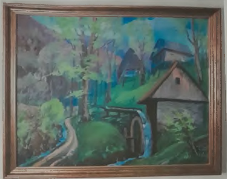
Front Side of the Painting "Water mill in the village of Nizhny Bystry"