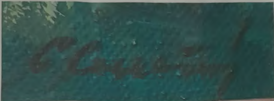
Signature of Stepan Sighetiy on the frontside of painting "Water mill in the village of Nizhny Bystry"

The signature of painter is located in the lower right corner on the frontside of painting in the black colour in the version on Ukrainian language "C. Cizemiü" what is the typical for Stepan Sighetiy.