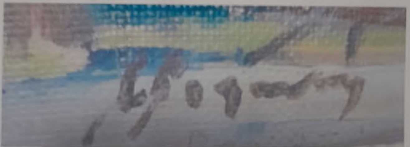
Example of the Signature of Stepan Sighetiy on his painting "St. Catherine's Church in Budapest", 1990. Private collection, Budapest, Hungary.

We can compare this signature with another signatures of Stepan Sighetiy, for example his painting "St. Catherine's Church in Budapest", 1990