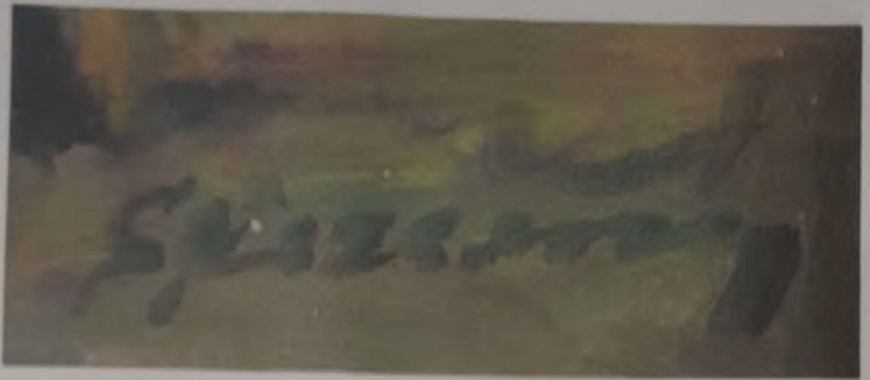
Signature of Stepan Sighetiy on the frontside of painting "House under the mountain"

The signature of painter is located in the lower right corner on the frontside of painting in the dark green colour in the version on Ukrainian language "С. Сігетій" what is the typical for Stepan Sighetiy.