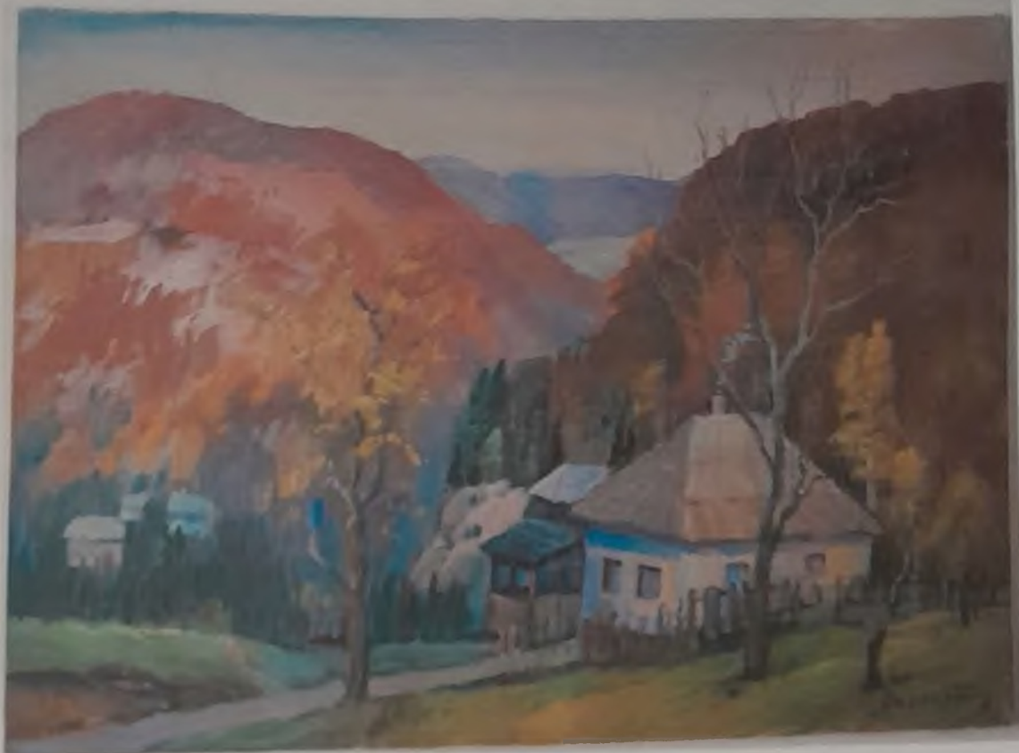
Front Side of the Painting "House under the mountain"